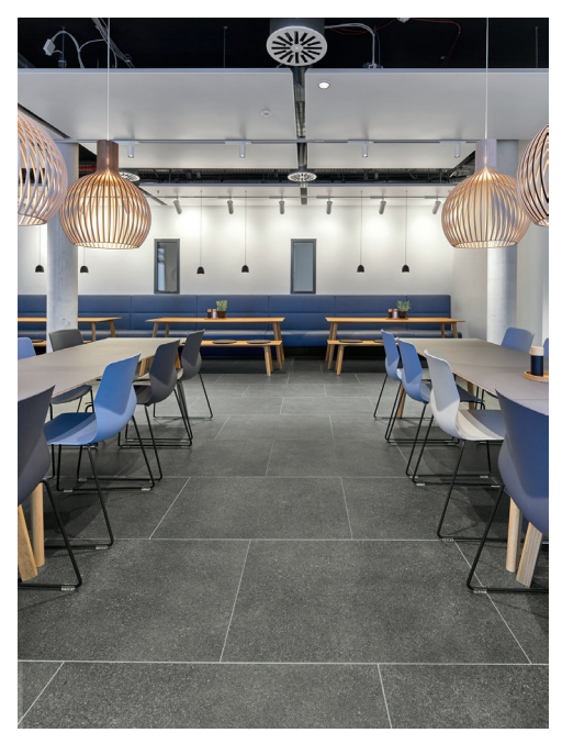
A modern open-office concept with this canteen promotes the required level of encounter, exchange and flexibility, where team meetings also find their appropriate place.