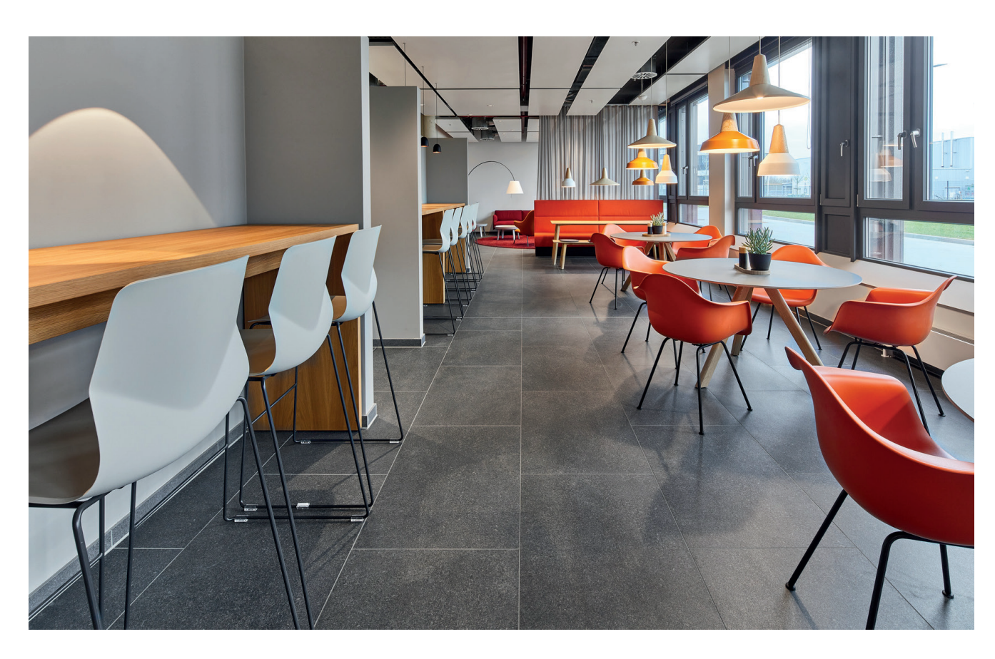
Area Pro stretches the space. Maximum flexibility and spaces that can react as easily as quickly to changing requirements are part of Coherent's new work concept, not only in the canteen with its adjacent meeting room.